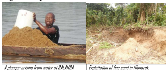
A plunger arising from water at BALAMBA